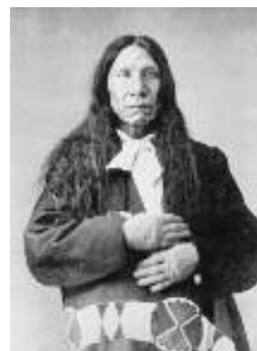
Red Cloud 1872