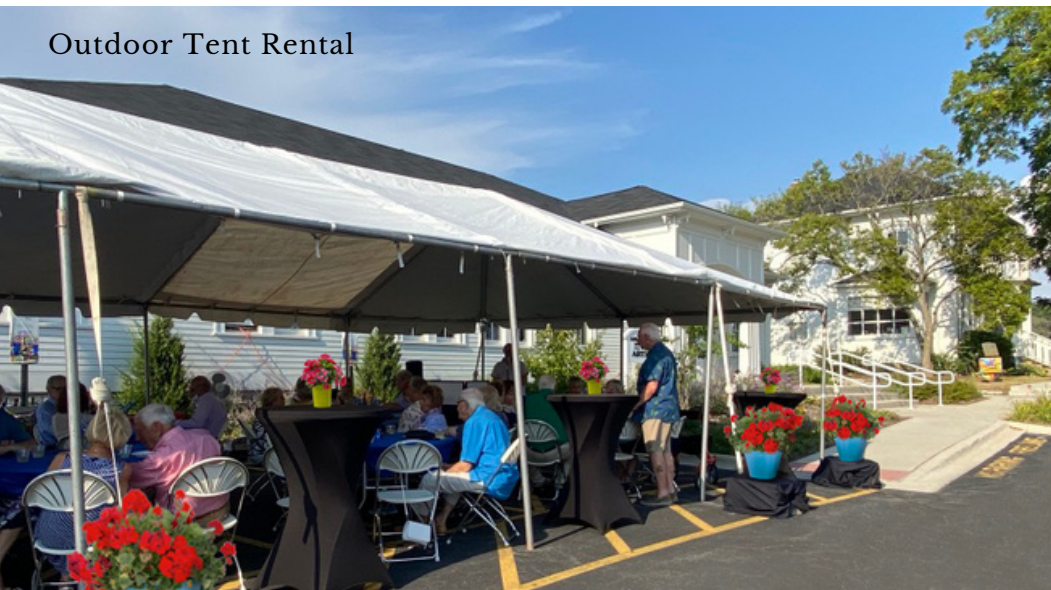
Outdoor Tent Rental

With a capacity of 100 people, you have the freedom to provide the food, entertainment, tables, and chairs to suit your special event.